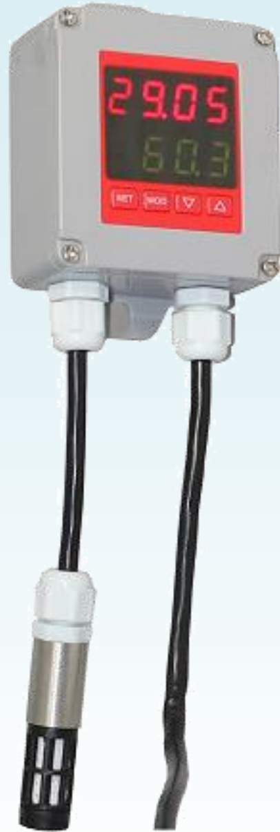
Temperature And Humidity Transmitter